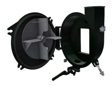
Hydraulic drive or PTO drive Swing Away Fan