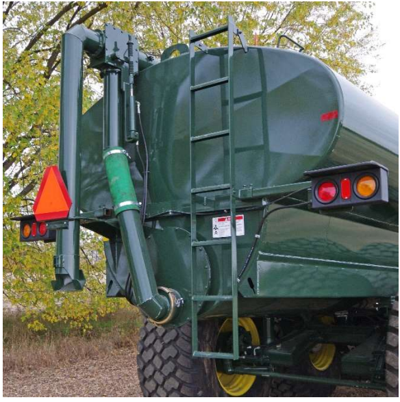
4 ft low spread and in tank agitation

Not all tanks can handle sand bedding. Call for more details.